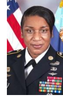
CSM TOMEKA N. O'NEAL, USA SENIOR ENLISTED LEADER